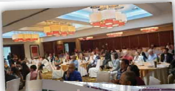
Sharing with leaders in Panama (left) & in Puerto Rico (lower pic)