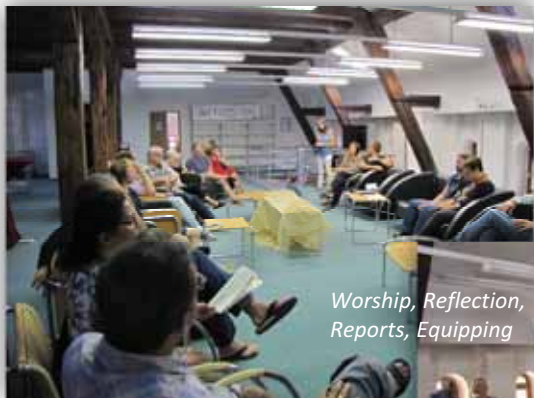
Worship, Reflection, Reports, Equipping

If you would like to see a summary video you can go to our website ( icmcanada.org ) and click on YouTube icon on top. From our YouTube channel you can click on MCNet IC 2019 video under the Inspirational playlist.