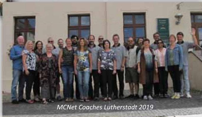
MCNet Coaches Lutherstadt 2019

While there have been additional renewals within the Protestant churches since then, we believe there is need for a structural renewal (new wineskins) on how we view and practice leadership within the