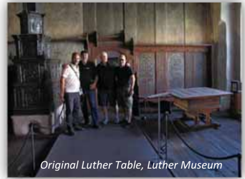
Original Luther Table, Luther Museum

Five hundred and two years ago, Martin Luther nailed a declaration to the door of a church in a small town in Germany called Wittenberg. This led to a Reformation of the then known church, that resulted in the Protestant movement. His basic goal was to return the church to a focus on the Scripture for faith and salvation