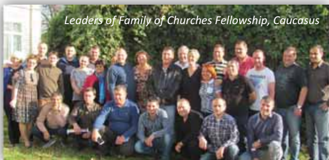
Leaders of Family of Churches Fellowship, Caucasus