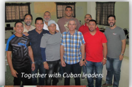
Together with Cuban leaders