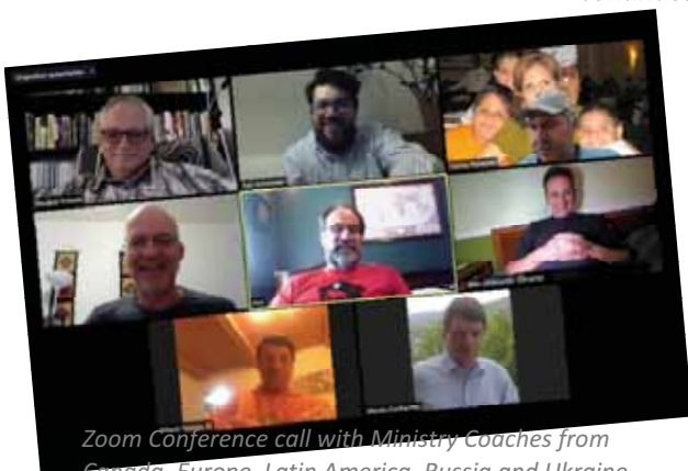
Zoom Conference call with Ministry Coaches from Canada, Europe, Latin America, Russia and Ukraine

Thank you for your continued partnership with ICM during these challenging times. We realize that each of you are also being impacted in many ways during this global pandemic. Your support enables us to carry on with the important writing and development of materials and providing teleconferences and coaching as each of the coaches continue to train leaders in these times when leadership is so vital.