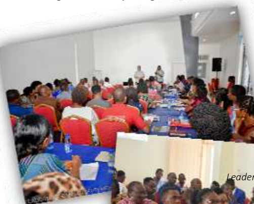
Leadership Conference, TZ

men and so it was great to provide some one-on-one coaching with him as he has a vision of reaching into