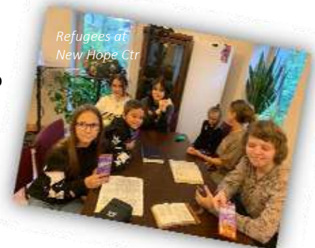
Refugees at New Hope Ctr