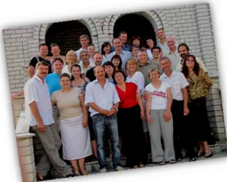
First Leader’s Marriage Training in Russia 2010