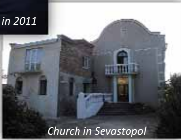
Church in Sevastopol