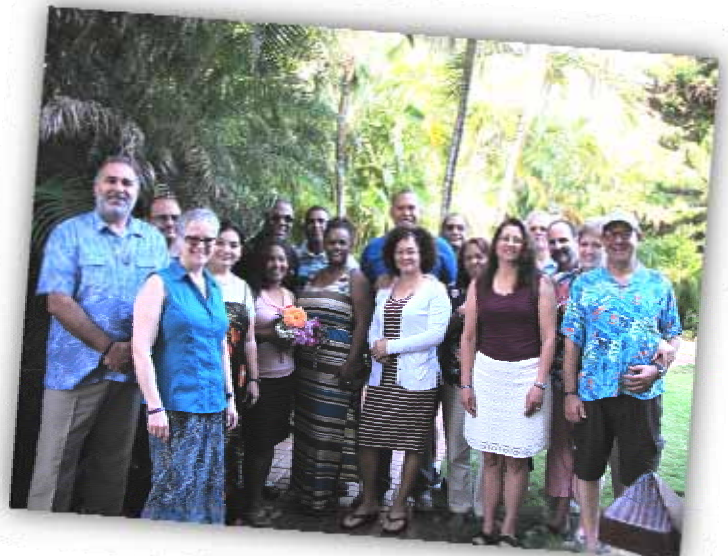
First Leader’s Marriage Training in Latin America (Dominican Rep.) 2018