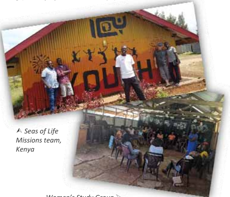
▲ Seas of Life Missions team, Kenya