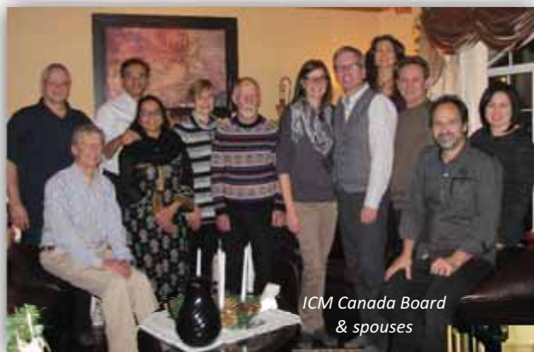
ICM Canada Board & spouses

ICM Canada is blessed to have a board who not only provides accountability for the ministry, but shares the same vision and passion to train leaders around the world. Each has a lifetime of experience and volunteers their time to the work and vision of ICM and have done so for many years. While their pictures do not typically appear in the Update they are a valuable part of our team and the work would not be possible without them.