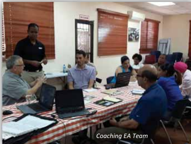
Coaching EA Team

While static pictures of leaders sitting around discussing and learning may not seem that exciting, what the picture cannot convey is the results of these meetings. Over time what happens is that the priorities of these leaders change as do their values. This results in the positive impact with those they serve. Instead of leadership being about position and power it becomes about helping others discover who God made them and being effective in