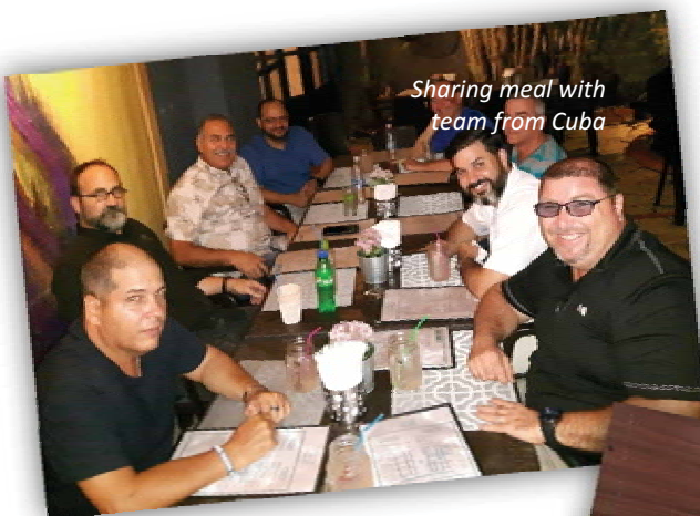
Sharing meal with team from Cuba

team. He and his team has also travelled to meet with interested leaders from other Latin American countries in order to provide leadership training in their countries. From all nations to all nations rather than just "from the West to the rest."